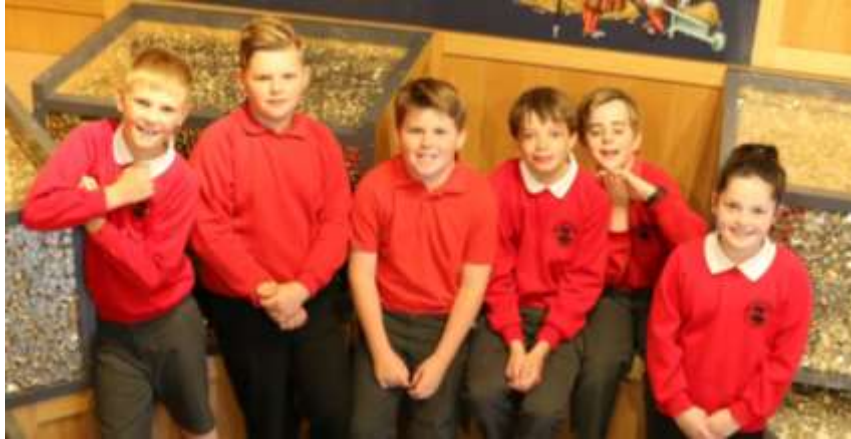
Our Year 6 children enjoying their last school trip

Boswell Road Lower Westwood Bradford on Avon BA15 2BY