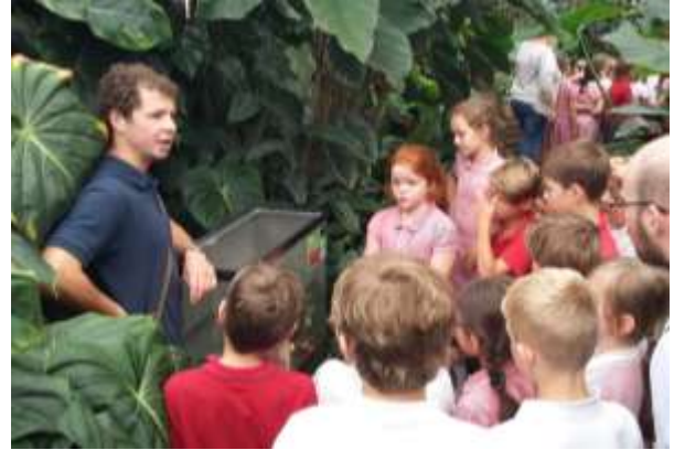
Children enjoying their class trips to Langford Lakes and the Living Rainforest

Hello again from a very busy but exciting Westwood school! With just three weeks to go until the end of a year that has been full of great learning, fantastic activities and fun there is still so much to look forward to in the few weeks we have together.