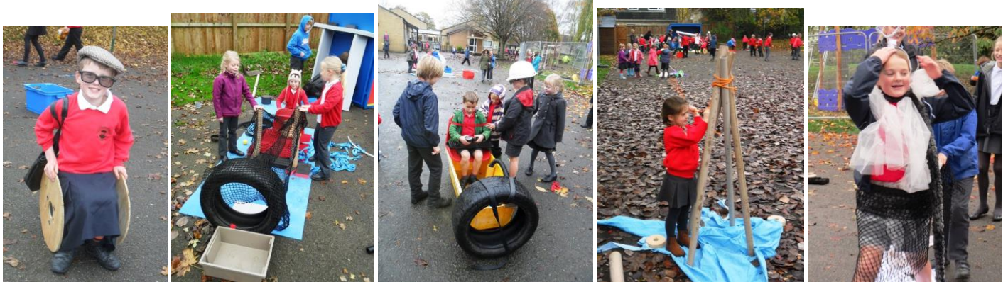
The children showing incredible imagination with our wonderful new PlayPod

Boswell Road Lower Westwood Bradford on Avon BA15 2BY