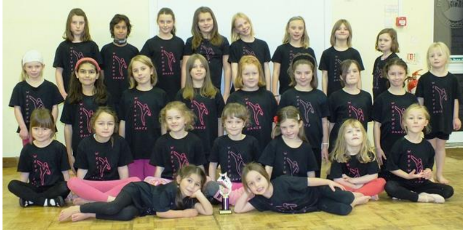
Our very own Westwood Dance Club and Orchid Class have something to celebrate.

Boswell Road Lower Westwood Bradford on Avon BA15 2BY